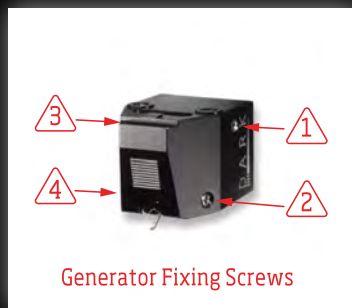
Generator Fixing Screws

DO NOT touch or attempt to adjust these four screws. Tampering with these screws will void the warranty.